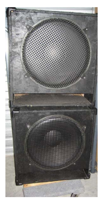
18 inch Sub Speakers Complete

NOT SEEN Equipment Rack Boxes/Show Boxes/Portable Stage/Mobile Recording Studio & Video Production Center