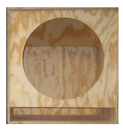
Zach1801-18 inch Sub Speaker Cabinet