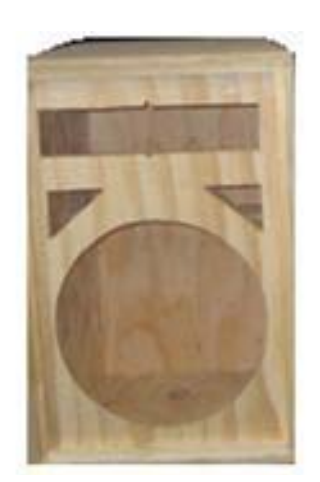
Zach1501- 15 inch High Top Speaker Cabinet